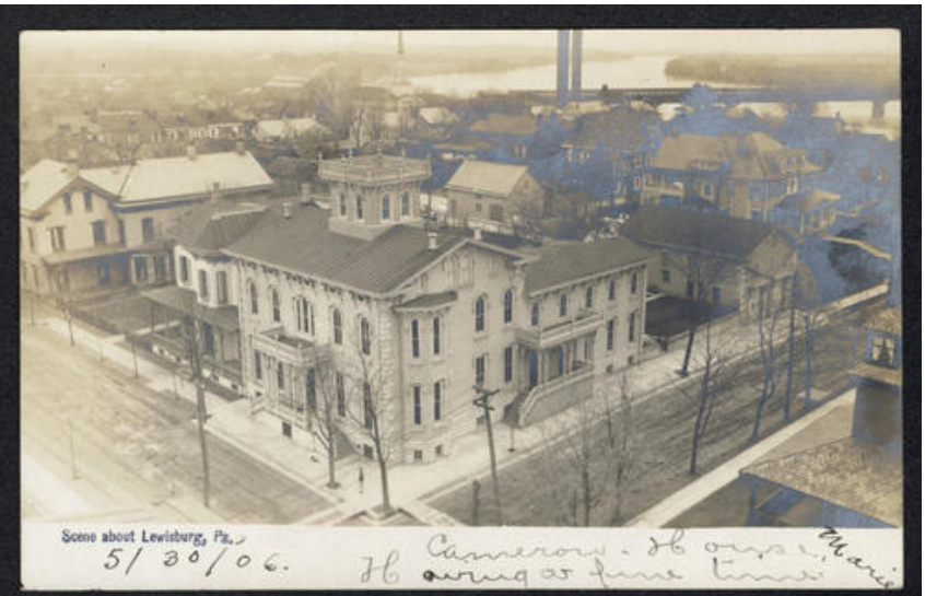
Historic Postcard of Union County

It is important that PA SHPO collects information about the older and historic places that Pennsylvanian's value in their communities. PA SHPO welcomes public recommendations for places that should be documented in this survey. If you would like to provide your feedback, please fill out this <u>short survey form</u>.