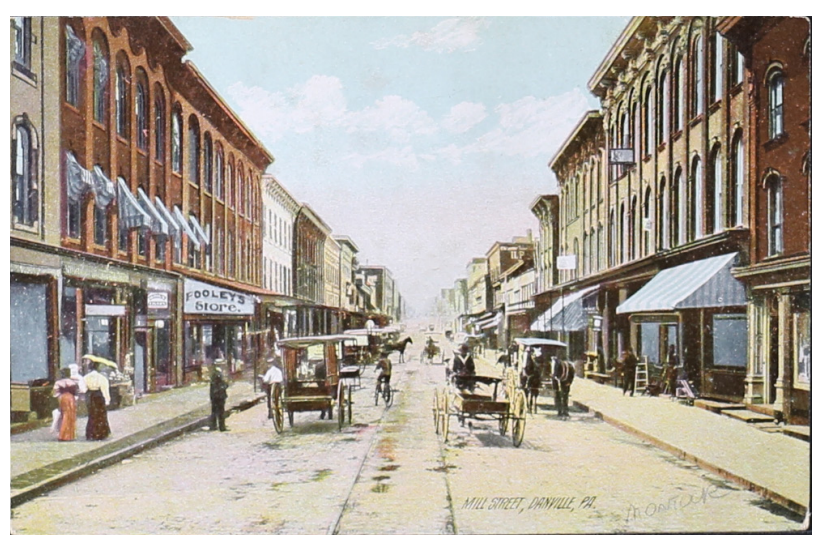
Historic Postcard of Montour County

It is important that PA SHPO collects information about the older and historic places that Pennsylvanian's value in their communities. PA SHPO welcomes public recommendations for places that should be documented in this survey. If you would like to provide your feedback, please fill out this <u>short survey form</u>.