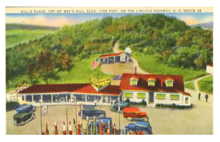
Historic Postcard of Bill's Place Rest Stop in Fulton County

It is important that PA SHPO collects information about the older and historic places that Pennsylvanian's value in their communities. PA SHPO welcomes public recommendations for places that should be documented in this survey. If you would like to provide your feedback, please fill out this <u>short survey form</u>.