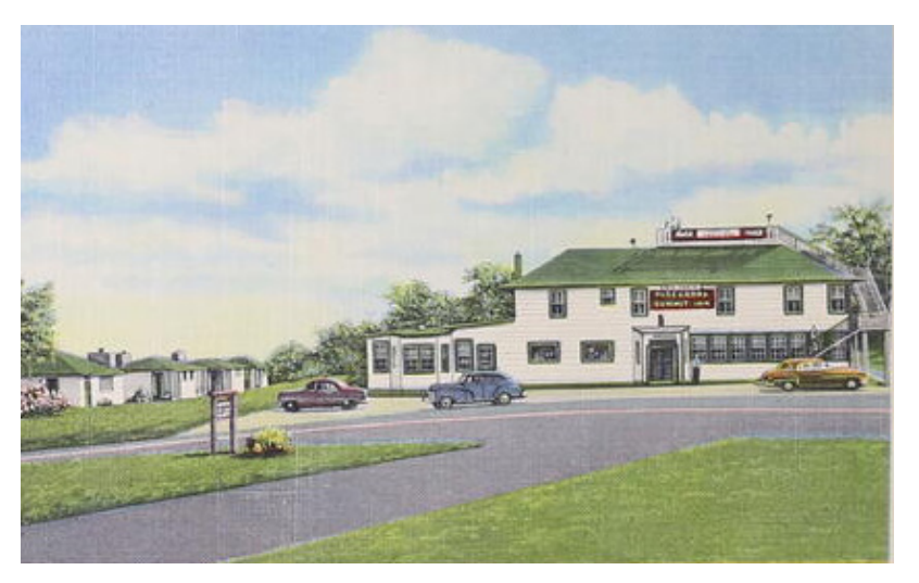
Historic Postcard of Tuscarora Summit Inn, Franklin County

It is important that PA SHPO collects information about the older and historic places that Pennsylvanian's value in their communities. PA SHPO welcomes public recommendations for places that should be documented in this survey. If you would like to provide your feedback, please fill out this <u>short survey form</u>.